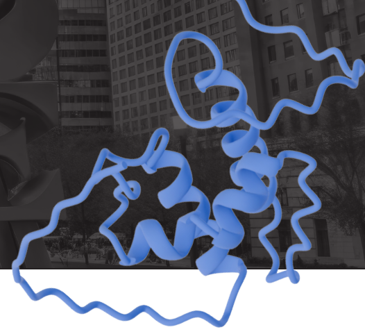
EXHIBIT HALL AND SIGNAGE OPPORTUNITIES