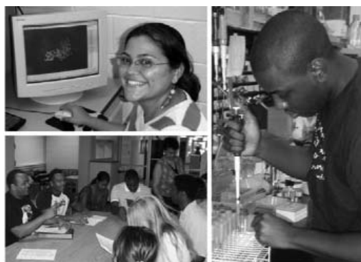
Students are given a thorough introduction to course and lab experience.