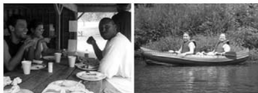
Students enjoy group picnic & rafting trip.

University of North Carolina, Chapel Hill